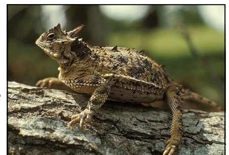
Texas Horned Lizard

The Texas Horned Lizard ( Phrynosoma cornutum ) is a native reptile species and is the Texas state reptile. Presently they are a threatened species due to loss of habitat and pesticide use. What makes this reptile so remarkable is its horned body, only scary to its predators, with two prominent spines on the crown of his head. It is a very docile lizard that loves to eat harvester ants and bask in the sun in areas where it is mostly open and dry. They lay their eggs underground and hibernate during the winter. Some of its very cool defense mechanisms include hissing, puffing out its body, and blood shooting eyeballs (used only as a last defense)! The color of its body is also excellent for camouflage. The Texas Horned Lizard has been spotted a couple of times on our grounds in the last few months so make sure you visit our site for a glimpse of this camouflaged creature!